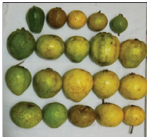
Habitat of naturalised guava population in Pithoragarh district (Left) and fruit variability (Right)